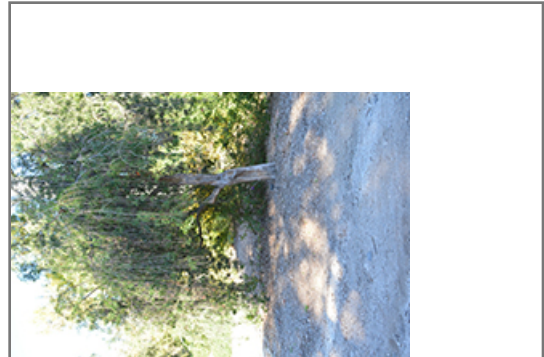
Red Cascade Bottlebrush