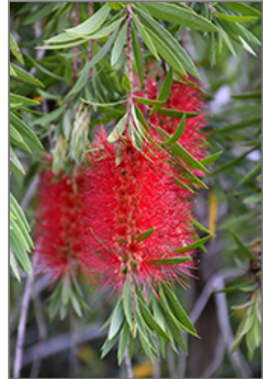
Red Cascade Bottlebrush flowers

Red Cascade Bottlebrush is recommended for the following landscape applications;