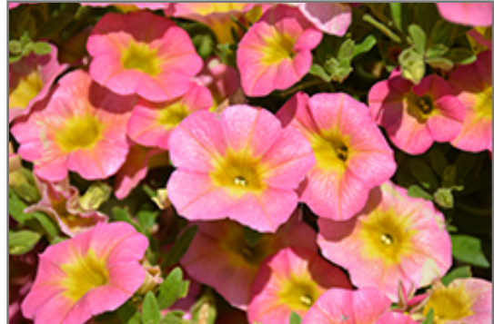
Callie Pink Morn Calibrachoa flowers

Callie Pink Morn Calibrachoa is recommended for the following landscape applications;