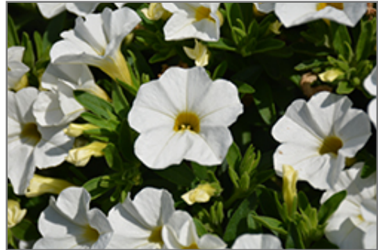
Calipetite White Calibrachoa flowers