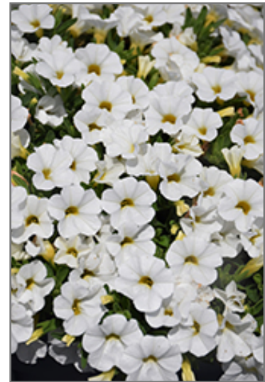
Calipetite White Calibrachoa flowers

This plant will require occasional maintenance and upkeep. Trim off the flower heads after they fade and die to encourage more blooms late into the season. It is a good choice for attracting bees and hummingbirds to your yard, but is not particularly attractive to deer who tend to leave it alone in favor of tastier treats. It has no significant negative characteristics.