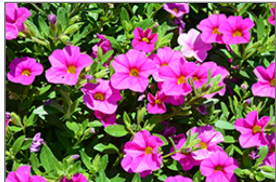
Aloha Nani Pink Calibrachoa flowers

Aloha Nani Pink Calibrachoa is recommended for the following landscape applications;