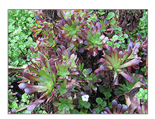
Tip Top Aeonium

When grown indoors, Tip Top Aeonium can be expected to grow to be about 12 inches tall at maturity, with a spread of 12 inches. It grows at a medium rate, and under ideal conditions can be expected to live for approximately 10 years. This houseplant will do well in a location that gets either direct or indirect sunlight, although it will usually require a more brightly-lit environment than what artificial indoor lighting alone can provide. It prefers dry to average moisture levels with very well-drained soil, and may die if left in standing water for any length of time. This plant should be watered when the surface of the soil gets dry, and will need watering approximately once each week. Be aware that your particular watering schedule may vary depending on its location in the room, the pot size, plant size and other conditions; if in doubt, ask one of our experts in the store for advice. It is not particular as to soil type or pH; an average potting soil should work just fine.