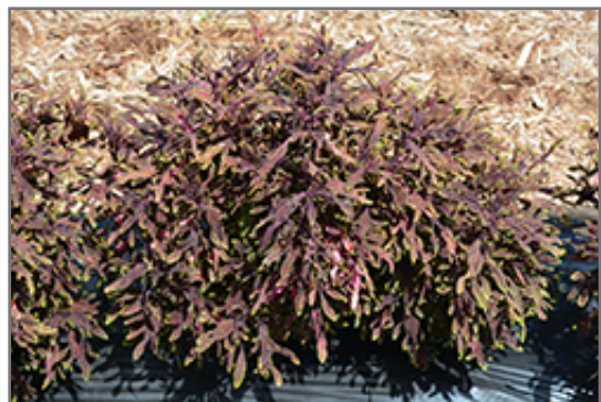
Under The Sea Lion Fish Coleus