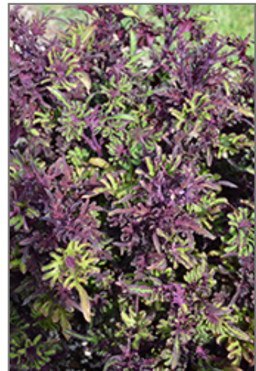
Under The Sea Lime Shrimp Coleus foliage