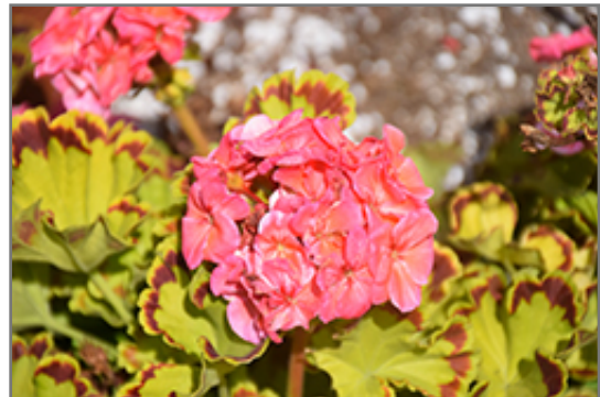
Glitterati Diva Queen Geranium flowers