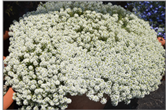
Snow Globe Alyssum in bloom