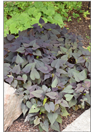
Sweet Georgia Heart Purple Sweet Potato Vine