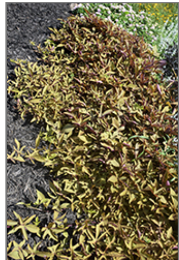
South of the Border Refried Beans Sweet Potato Vine