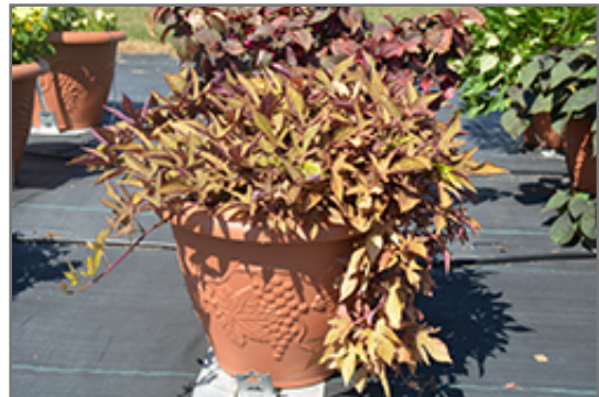
South of the Border Refried Beans Sweet Potato Vine

South of the Border Refried Beans Sweet Potato Vine will grow to be about 8 inches tall at maturity, with a spread of 3 feet. When grown in masses or used as a bedding plant, individual plants should be spaced approximately 12 inches apart. Its foliage tends to remain low and dense right to the ground. This fast-growing annual will normally live for one full growing season, needing replacement the following year.