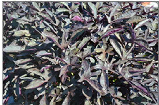
South of the Border Black Beans Sweet Potato Vine foliage