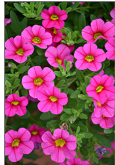
Catwalk Lipstick Pink Calibrachoa flowers

Catwalk Lipstick Pink Calibrachoa is recommended for the following landscape applications;