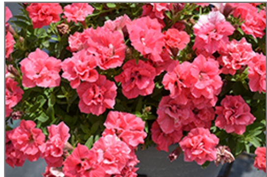
Surfinia Summer Double Salmon Petunia flowers

Surfinia Summer Double Salmon Petunia is recommended for the following landscape applications;