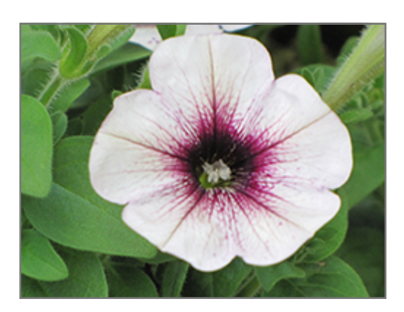
Good And Plenty Blue Ice Petunia flowers

Good And Plenty Blue Ice Petunia will grow to be about 10 inches tall at maturity, with a spread of 12 inches. When grown in masses or used as a bedding plant, individual plants should be spaced approximately 10 inches apart. Its foliage tends to remain low and dense right to the ground. This fast-growing annual will normally live for one full growing season, needing replacement the following year.