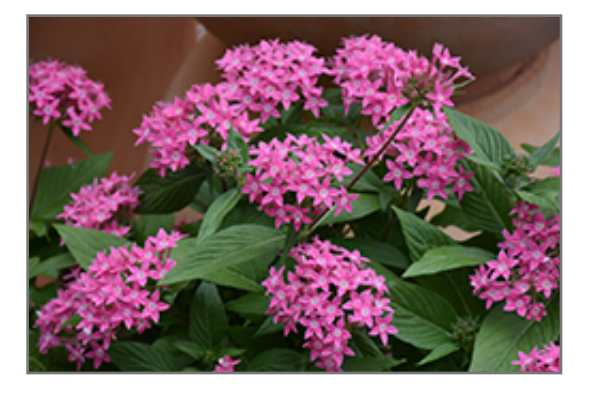
Butterfly Deep Pink Star Flower flowers