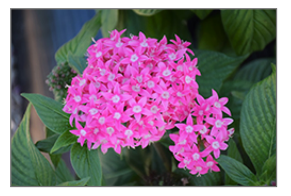
Butterfly Deep Pink Star Flower flowers