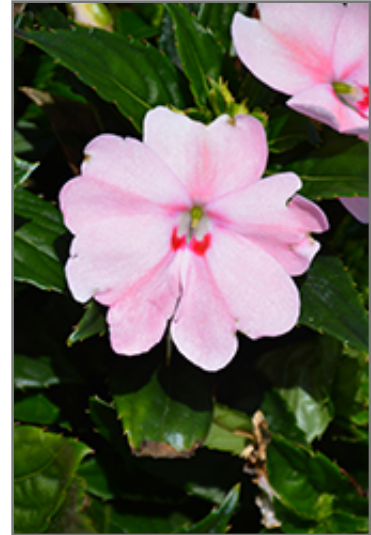
SunPatiens Spreading Pink Kiss New Guinea Impatiens flowers