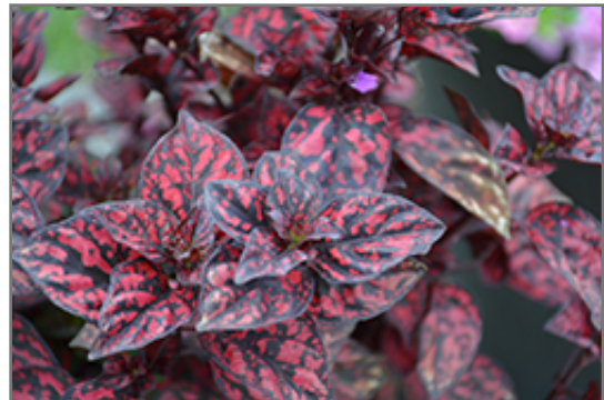
Hippo Red Polka Dot Plant foliage

Hippo Red Polka Dot Plant is recommended for the following landscape applications;