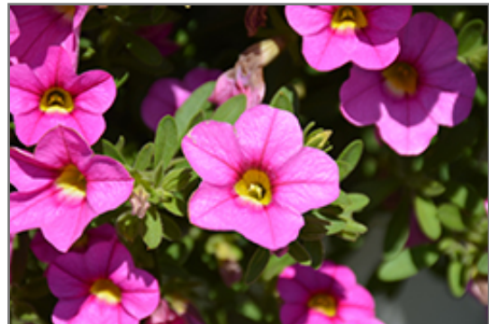
Million Bells Mounding Compact Pink Calibrachoa flowers

Million Bells Mounding Compact Pink Calibrachoa is recommended for the following landscape applications;