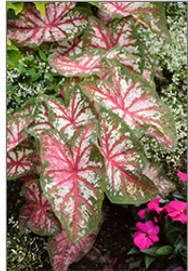
Artful Fire and Ice Caladium foliage