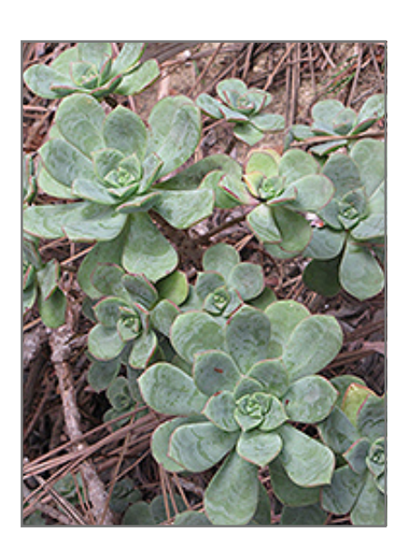
Pinwheel foliage

When grown indoors, Pinwheel can be expected to grow to be about 24 inches tall at maturity, with a spread of 24 inches. It grows at a medium rate, and under ideal conditions can be expected to live for approximately 10 years. This houseplant will do well in a location that gets either direct or indirect sunlight, although it will usually require a more brightly-lit environment than what artificial indoor lighting alone can provide. It prefers dry to average moisture levels with very well-drained soil, and may die if left in standing water for any length of time. This plant should be watered when the surface of the soil gets dry, and will need watering approximately once each week. Be aware that your particular watering schedule may vary depending on its location in the room, the pot size, plant size and other conditions; if in doubt, ask one of our experts in the store for advice. It is not particular as to soil type or pH; an average potting soil should work just fine.