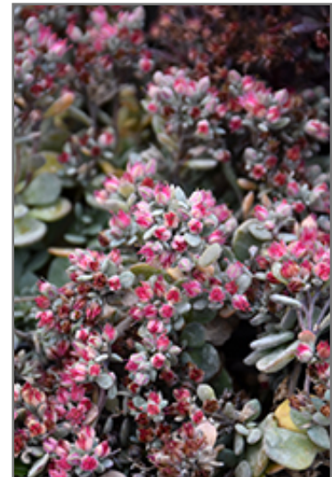
SunSparkler Blue Elf Sedoro flowers

SunSparkler Blue Elf Sedoro is a dense herbaceous perennial with a ground-hugging habit of growth. Its relatively fine texture sets it apart from other garden plants with less refined foliage.