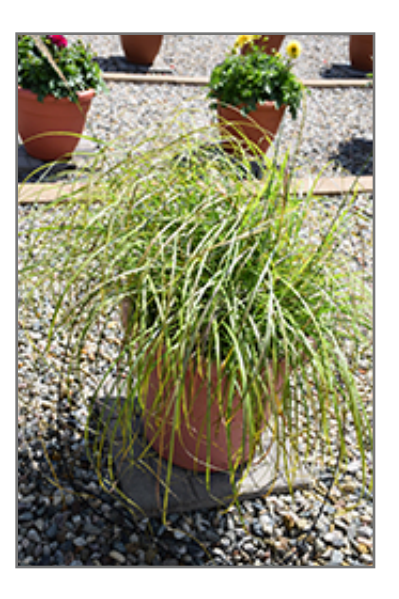
Little Miss Maiden Grass