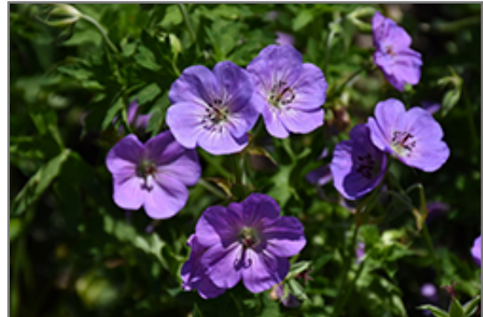
Azure Rush Cranesbill flowers