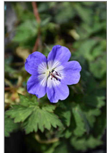
Azure Rush Cranesbill flowers

Azure Rush Cranesbill is recommended for the following landscape applications;