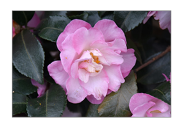
October Magic Orchid Camellia flowers

October Magic Orchid Camellia features showy semi-double white round flowers with shell pink overtones, yellow eyes and hot pink streaks at the ends of the branches from mid to late fall. It has dark green evergreen foliage. The small glossy pointy leaves remain dark green throughout the winter.