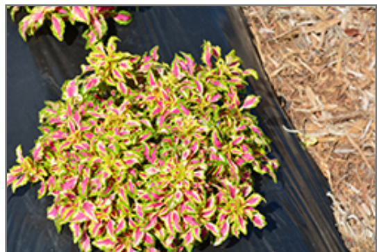
Terra Nova Magic Spell Coleus