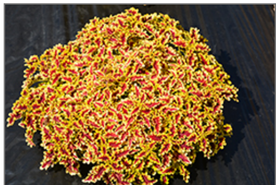
Terra Nova Lovebird Coleus