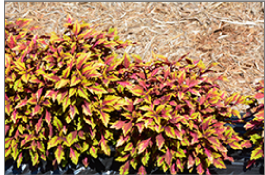
Terra Nova Allspice Coleus