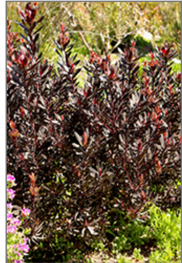
Ebony Conebush