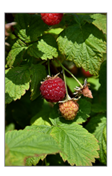
Festival Raspberry fruit

This is an open multi-stemmed deciduous shrub with an upright spreading habit of growth. Its relatively coarse texture can be used to stand it apart from other landscape plants with finer foliage. This is a high maintenance plant that will require regular care and upkeep. Each spring, cut back all dead and two-year old canes to the ground, leaving only last year's growth standing. It is a good choice for attracting birds to your yard. Gardeners should be aware of the following characteristic(s) that may warrant special consideration: