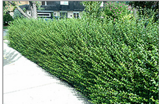
Amur Privet