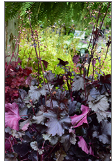
Black Pearl Coral Bells in bloom

Black Pearl Coral Bells is recommended for the following landscape applications;