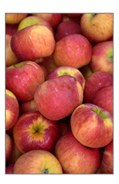
Topaz Apple fruit