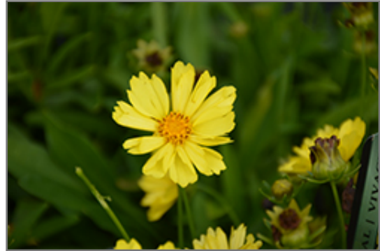
Leading Lady Sophia Tickseed flowers