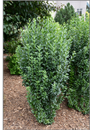
Straight Talk Privet