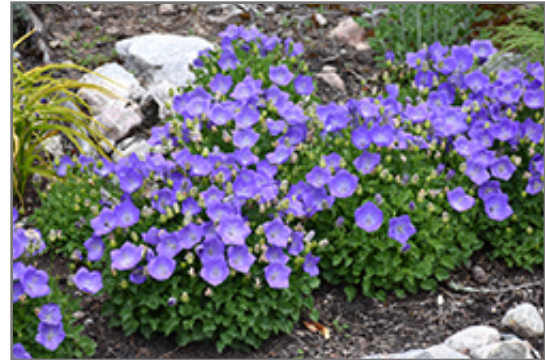
Rapido Blue Bellflower in bloom