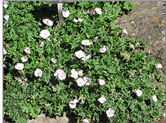
Striated Cranesbill in bloom