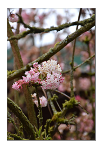
Charles Lamont Viburnum flowers