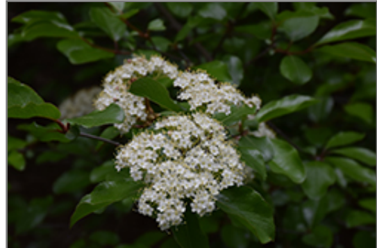
Emerald Charm Rusty Blackhaw flowers

Emerald Charm Rusty Blackhaw is a multi-stemmed deciduous shrub with an upright spreading habit of growth. Its relatively coarse texture can be used to stand it apart from other landscape plants with finer foliage.