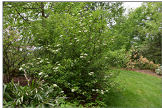
Emerald Charm Rusty Blackhaw in bloom