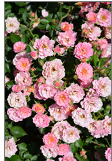
Oso Easy Petit Pink flowers