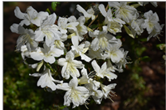
Stardust Azalea flowers

Stardust Azalea will grow to be about 6 feet tall at maturity, with a spread of 6 feet. It has a low canopy, and is suitable for planting under power lines. It grows at a slow rate, and under ideal conditions can be expected to live for 40 years or more.