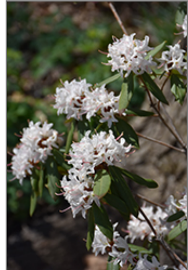
Montchanin Rhododendron flowers

Montchanin Rhododendron will grow to be about 5 feet tall at maturity, with a spread of 5 feet. It tends to be a little leggy, with a typical clearance of 1 foot from the ground, and is suitable for planting under power lines. It grows at a slow rate, and under ideal conditions can be expected to live for 40 years or more.