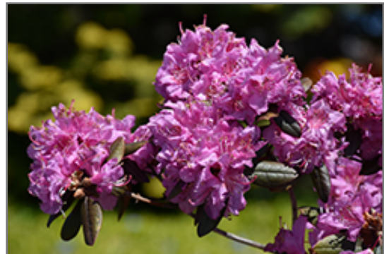
Midnight Ruby Rhododendron flowers