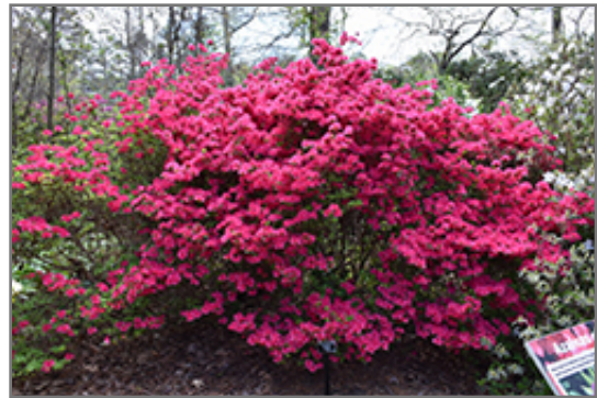
Hinode-giri Azalea in bloom

This shrub does best in a location that gets morning sunlight but is shaded from the hot afternoon sun, although it will also grow in partial shade. Keep it away from hot, dry locations that receive direct afternoon sun or which get reflected sunlight, such as against the south side of a white wall. It requires an evenly moist well-drained soil for optimal growth, but will die in standing water. It may require supplemental watering during periods of drought or extended heat. It is very fussy about its soil conditions and must have rich, acidic soils to ensure success, and is subject to chlorosis (yellowing) of the foliage in alkaline soils. It is somewhat tolerant of urban pollution, and will benefit from being planted in a relatively sheltered location. Consider applying a thick mulch around the root zone in winter to protect it in exposed locations or colder microclimates. This particular variety is an interspecific hybrid.