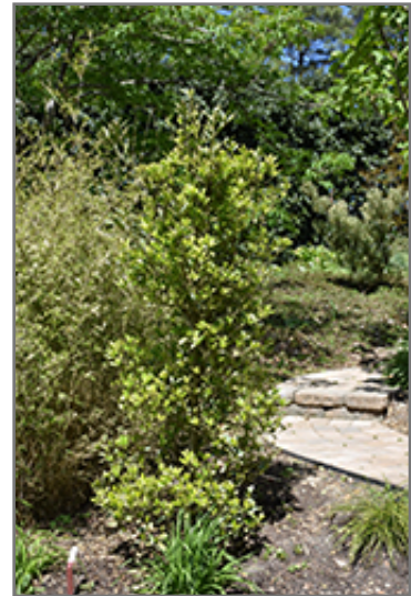
Green Shadow Variegated Nepal Holly