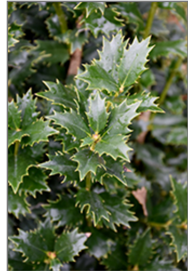
Acadiana Holly foliage