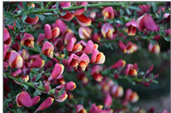
Burkwood's Broom flowers