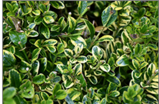
Wedding Ring Boxwood foliage