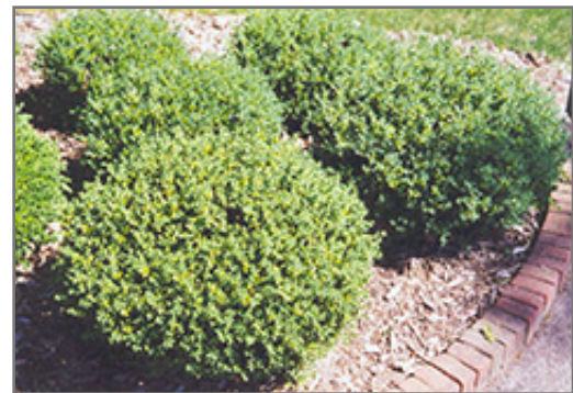
Japanese Boxwood