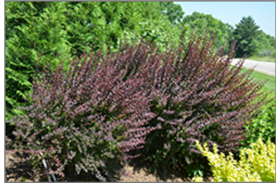
Sunjoy Syrah Japanese Barberry

Sunjoy Syrah Japanese Barberry is recommended for the following landscape applications;