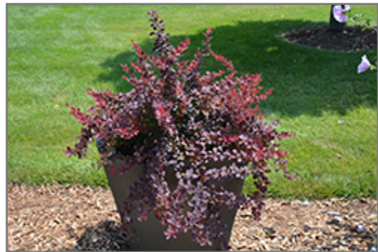
Sunjoy Syrah Japanese Barberry in bloom